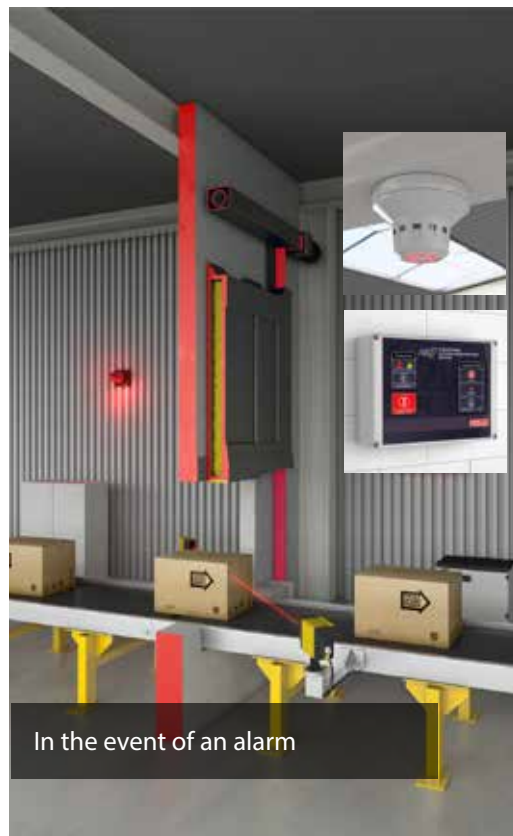
In the event of an alarm