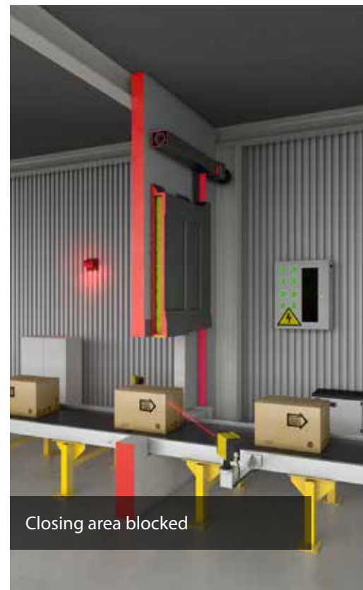
Closing area blocked